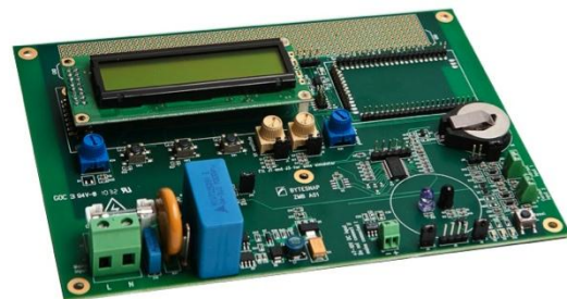
ZDM-01 Development kit